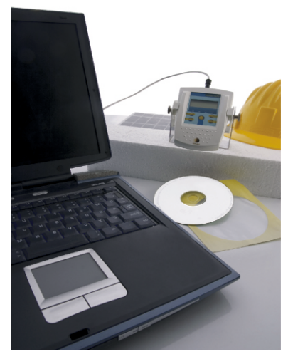
Read out process with MacView 2.0

MacSolar is a passive sensor for instant and long-term measuring of irradiance and temperature. 3 versions available: MacSolar , MacSolar E and MacSolar Sensor . Evaluation of the measured data using MacView 2.0 software possible.